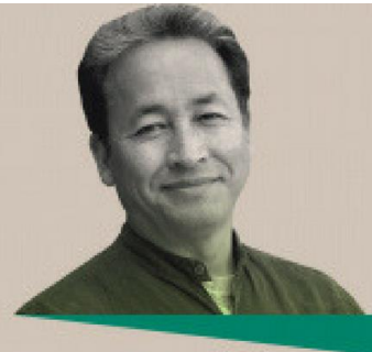
Sonam Wangchuk India HARNESSING NATURE, CULTURE, AND EDUCATION FOR COMMUNITY PROGRESS