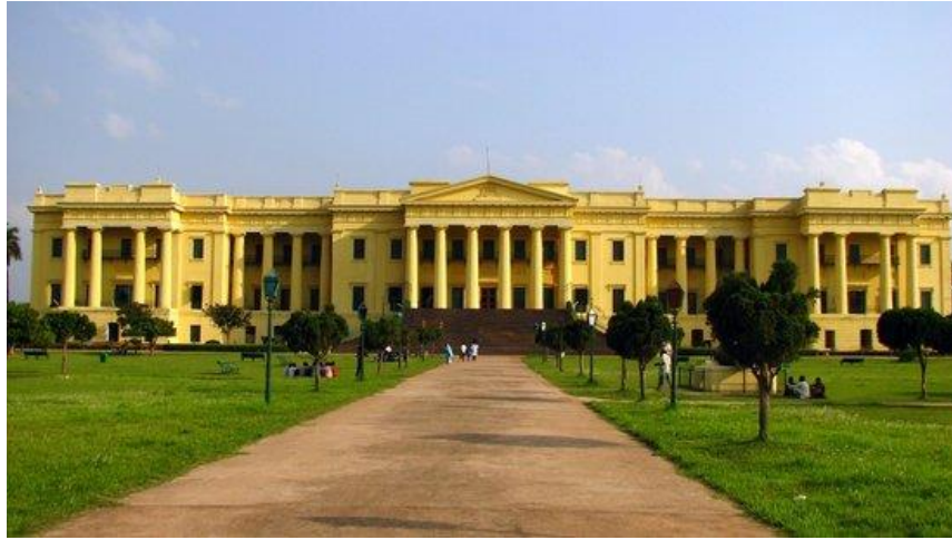
Hazarduari Palace (West Bengal)