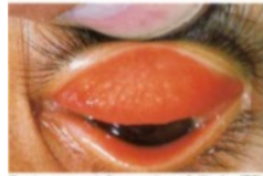
Trachomatous inflammation – follicular (TF).

Normal Conjunctiva (as described earlier)