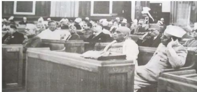
First day (December 9, 1946) of the Constituent Assembly . From right: B. G. Kher and Sardar Vallabhai Patel; K. M. Munshi is seated behind Patel.

The Constituent Assembly consisted of 385 members, of which 292 were elected by the elected members of the Provincial Legislative Assemblies while 93 members were nominated by the Princely States. To these were to be added a representative each from the four Chief Commissioners Provinces of Delhi, Ajmer- Marwar, Coorg and British Baluchistan.