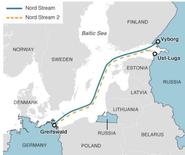
Nord Stream pipelines from Russia