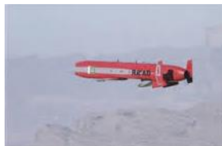
PAKISTAN CONDUCTS SUCCESSFUL FLIGHT TEST OF RA'AD-II CRUISE MISSILE