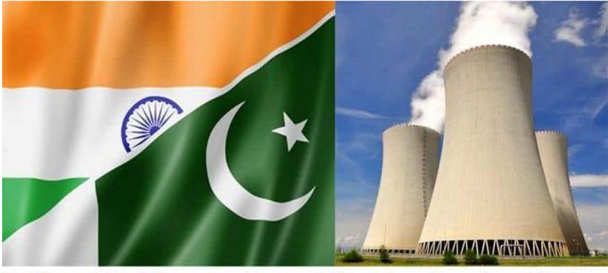
India and Pakistan exchanged list of nuclear installation