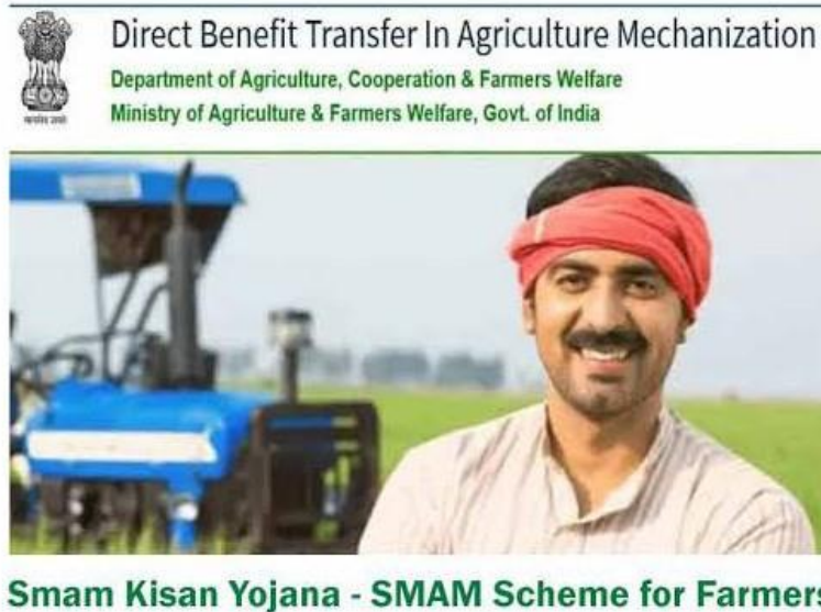
Smam Kisan Yojana - SMAM Scheme for Farmers