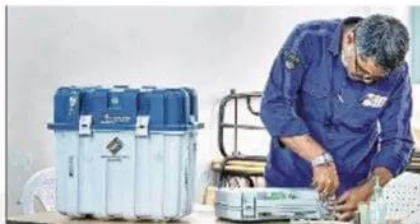
EVMs being sealed after an election