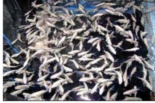
Pompano Fingerlings (1.5 inch size)