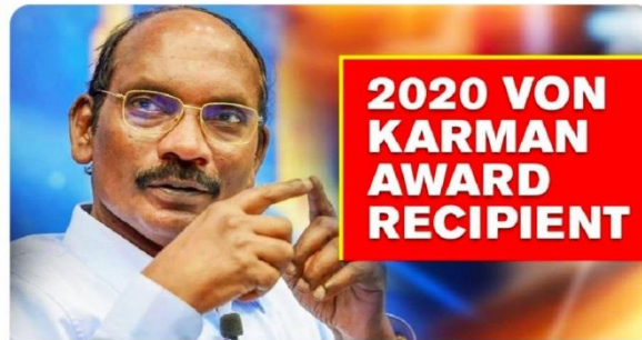
ISRO chief Sivan named as 2020 Von Karman award recipient by IAA, to be conferred in March -...