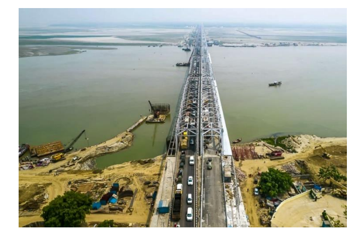
* * * * * * * * * *