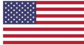
United States of America