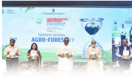
Swachh Vayu Sarvekshan- Ranking of Cities under National Clean Air Programme (NCAP)