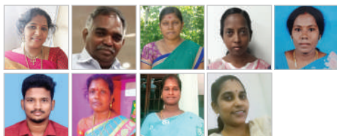
DATA ENTRY OPERATORS