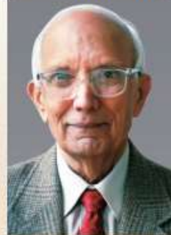
Prof. Rattan Lal

Distinguished University Professor / Director, Carbon Management and Sequestration Center, The Ohio State University