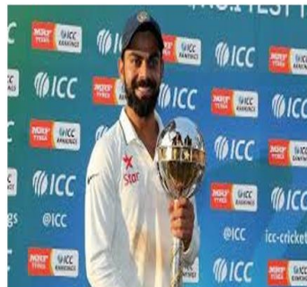
ICC Test Rankings